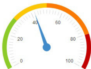
Average Answer time 42