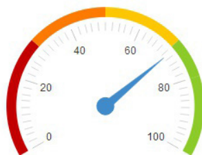
Percentage Answered 71